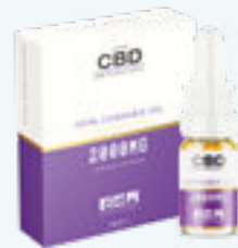
2000mg Refined Cannabis Oil CBD-DB-2000