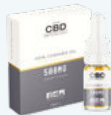
500mg Refined Cannabis Oil CBD-DB-0500