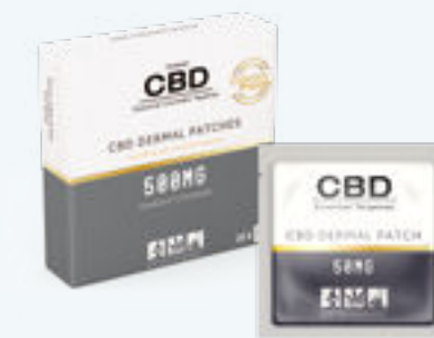
500mg Dermal Patches CBD-DP-0500