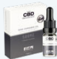
500mg Raw Cannabis Oil CBD-DBR-0500