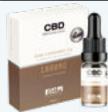
1000mg Raw Cannabis Oil CBD-DBR-1000