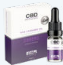
2000mg Raw Cannabis Oil CBD-DBR-2000