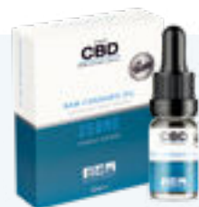
250mg Raw Cannabis Oil CBD-DBR-0250