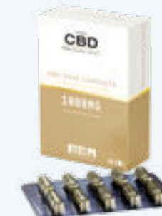
1000mg Cannabis Oral Capsules CBD-CAP-1000