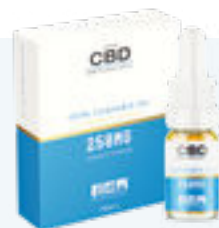
250mg Refined Cannabis Oil CBD-DB-0250

Ingredients: 99% Cannabis sativa L. Natural Terpene Flavourings (D-Limonene, L-Linalool, \alpha -Pinene, \beta -Pinene, \beta -Caryophyllene, \beta -Myrcene, Terpinolene, Humulene) Capsule: HPMC from Vegetable Cellulose.