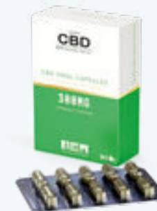
300mg Cannabis Oral Capsules CBD-CAP-0300