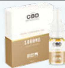
1000mg Refined Cannabis Oil CBD-DB-1000